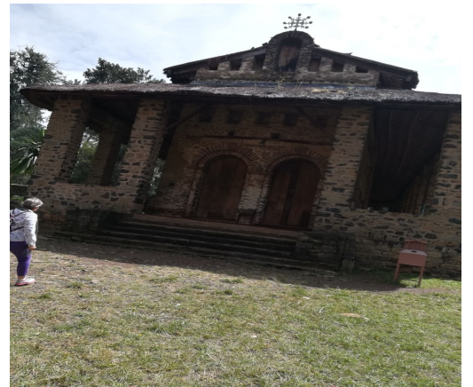
Debre Berhan Selassie church