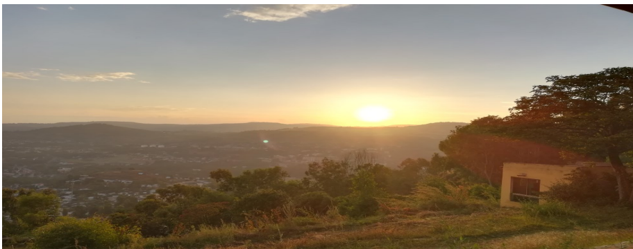
Sunset at the Goha Hotel

Amesegnalehu to everyone in Gondar, after many cups of coffee I am now your ‘friend’. Thank you to the Leicester-Gondar Link for making this opportunity for me possible.