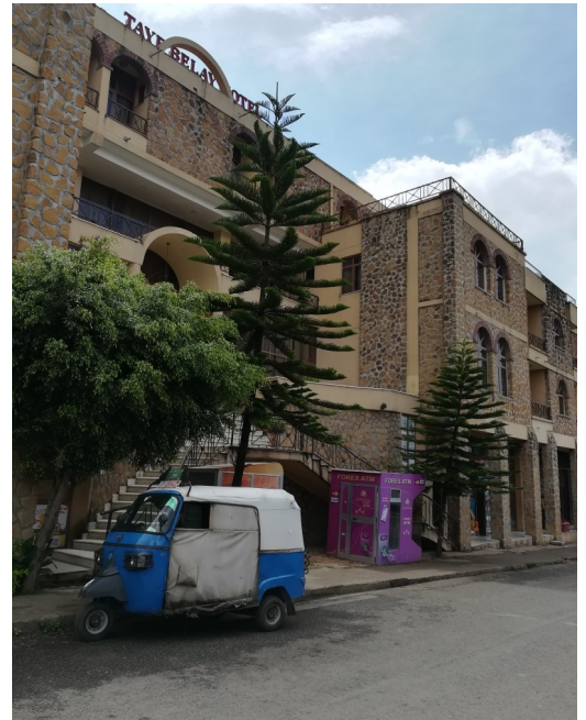
Taye Belay Hotel