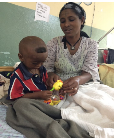
A small boy plays with a rattle